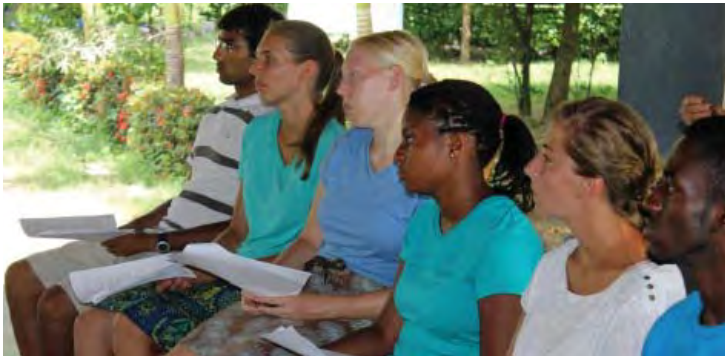
Duke Engage students at relaxation training for Fondwa women