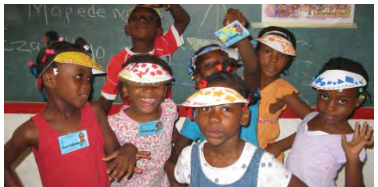
Vacation Bible School in Blanchard