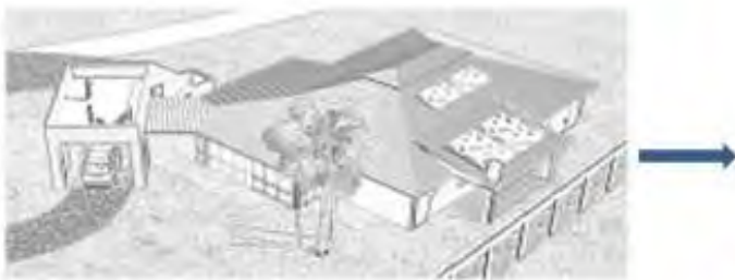
Designed by Hite Associates, Greenville, NC