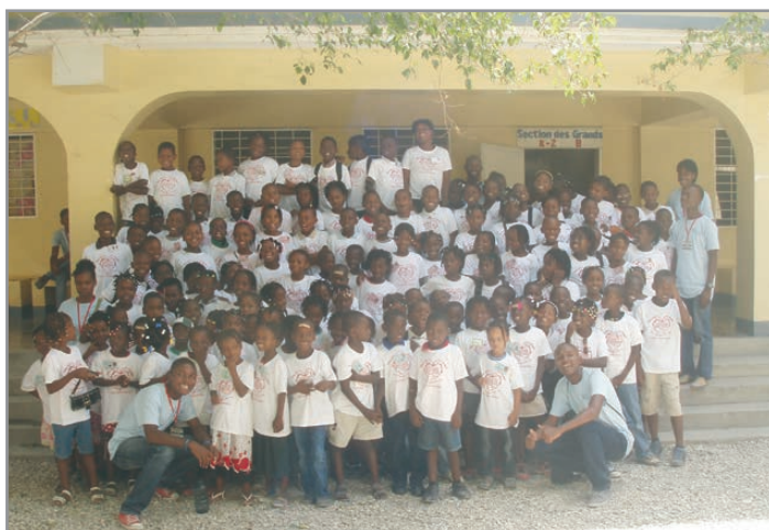
With the help of fabulous Haitian staff and translators, 2014 was another great VBS in Blanchard for 175 local children.

Interested in traveling to Haiti to serve on the 2015 VBS trip? The dates are July 18-26th, 2015 and you can register online at FamilyHM.org .