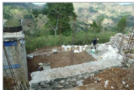
A dining hall under construction at the orphanage. (Photo taken Nov. 2014)

The new dining hall is funded by a group based in Indianapolis called Barn Raisers, who helped fund and build the new cistern. The Fatima House kids don't have a place to gather as a community to eat; they eat on their beds. The