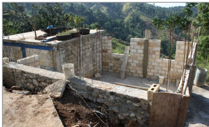
The dining hall under construction.