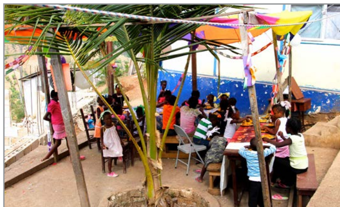
Children at the orphanage dine outside under a tarp when the weather is nice. Otherwise, they will eat their meals on their beds.