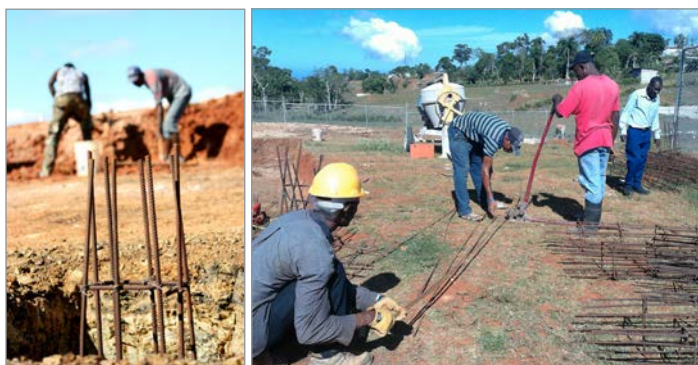
Crews work on site Monday through Saturday.