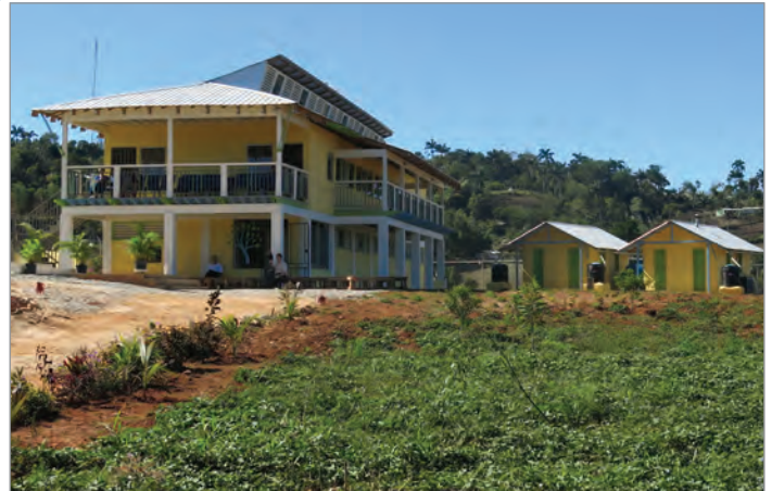
Women's Center in Tom Gato

Over the last 3 years, FHM's staff has provided healthcare to an average of over 300 women per month including prenatal and postnatal care. The birthing side of the facility remained closed while we worked to secure funding for its operation. We are excited to announce that this Fall we will be taking a giant leap of faith and opening the much-anticipated birthing center. This means that the current budget for the center will increase by $40,000/year with the addition of 6 new staff members to keep the center open 24 hours, 7 days a week.